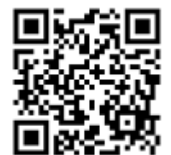
Exhibit with a fee