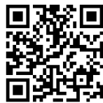
Exhibit free of charge in principle